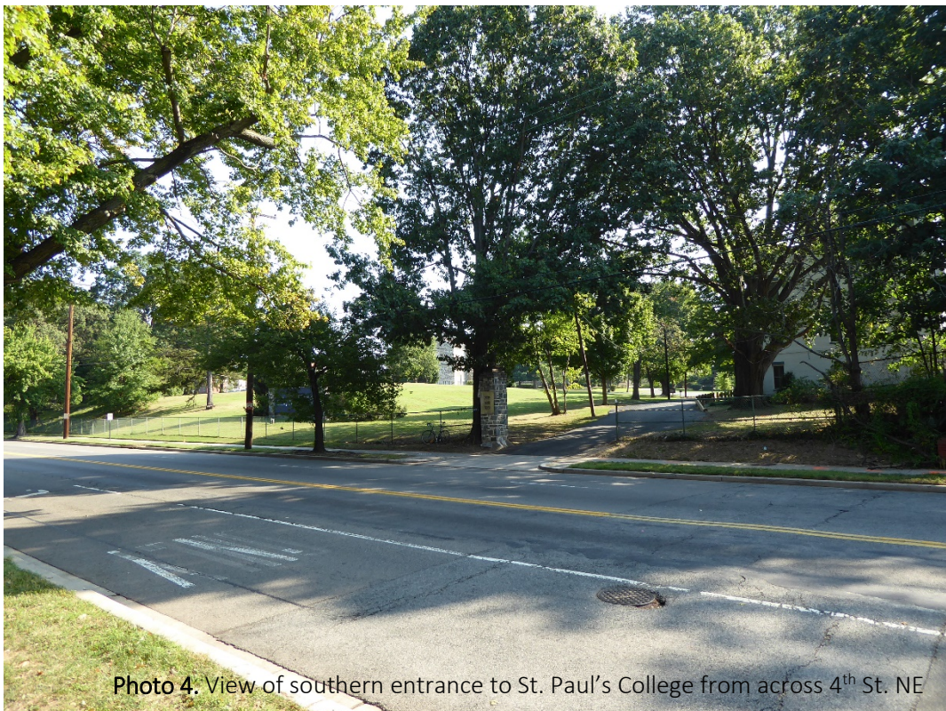
Photo 4. View of southern entrance to St. Paul's College from across 4 th St. NE