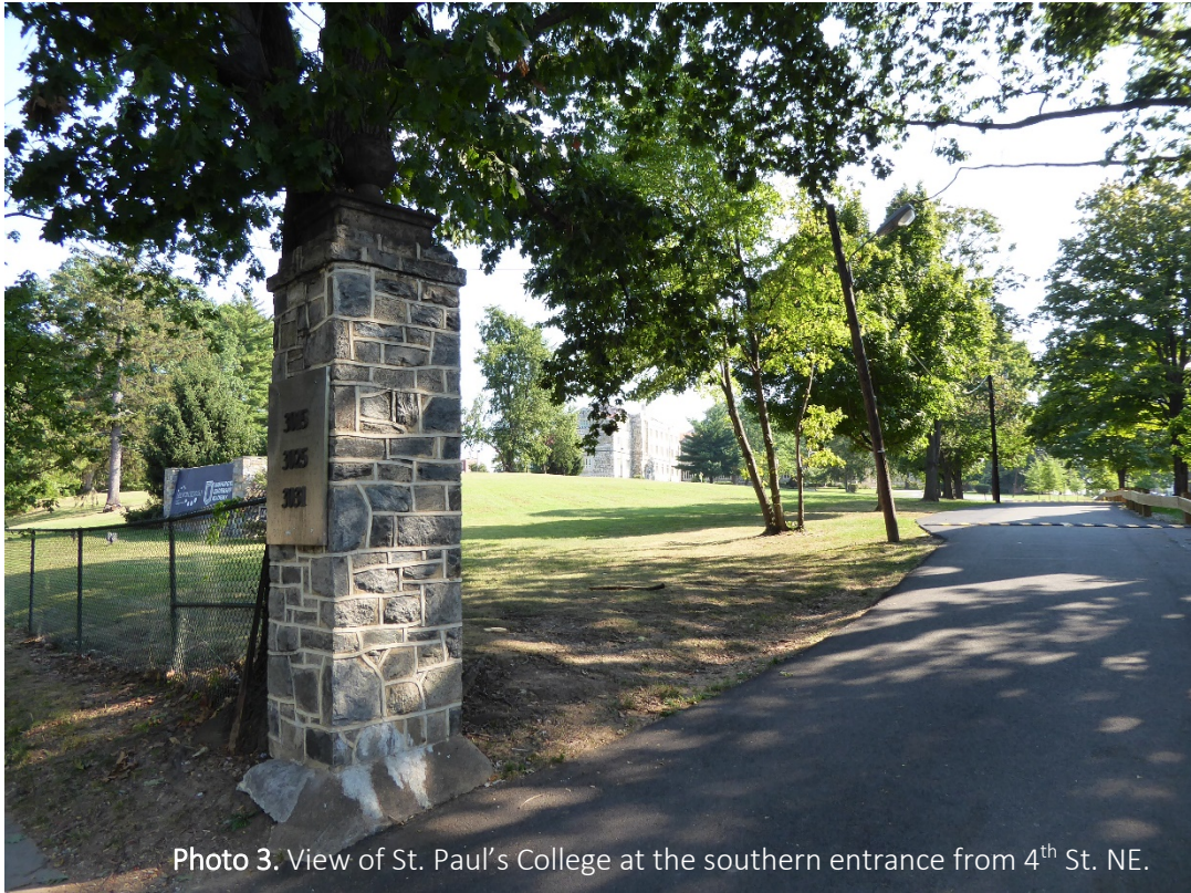
Photo 3. View of St. Paul's College at the southern entrance from 4 th St. NE.