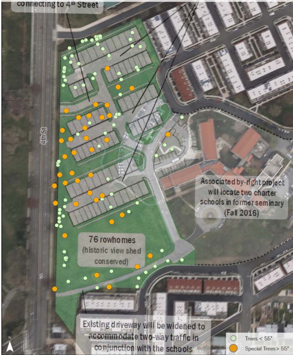
Figure 1. Boundary Cos.' townhome development proposal would remove 70 trees, including a historic grove of mature trees along 4 th Street NE.