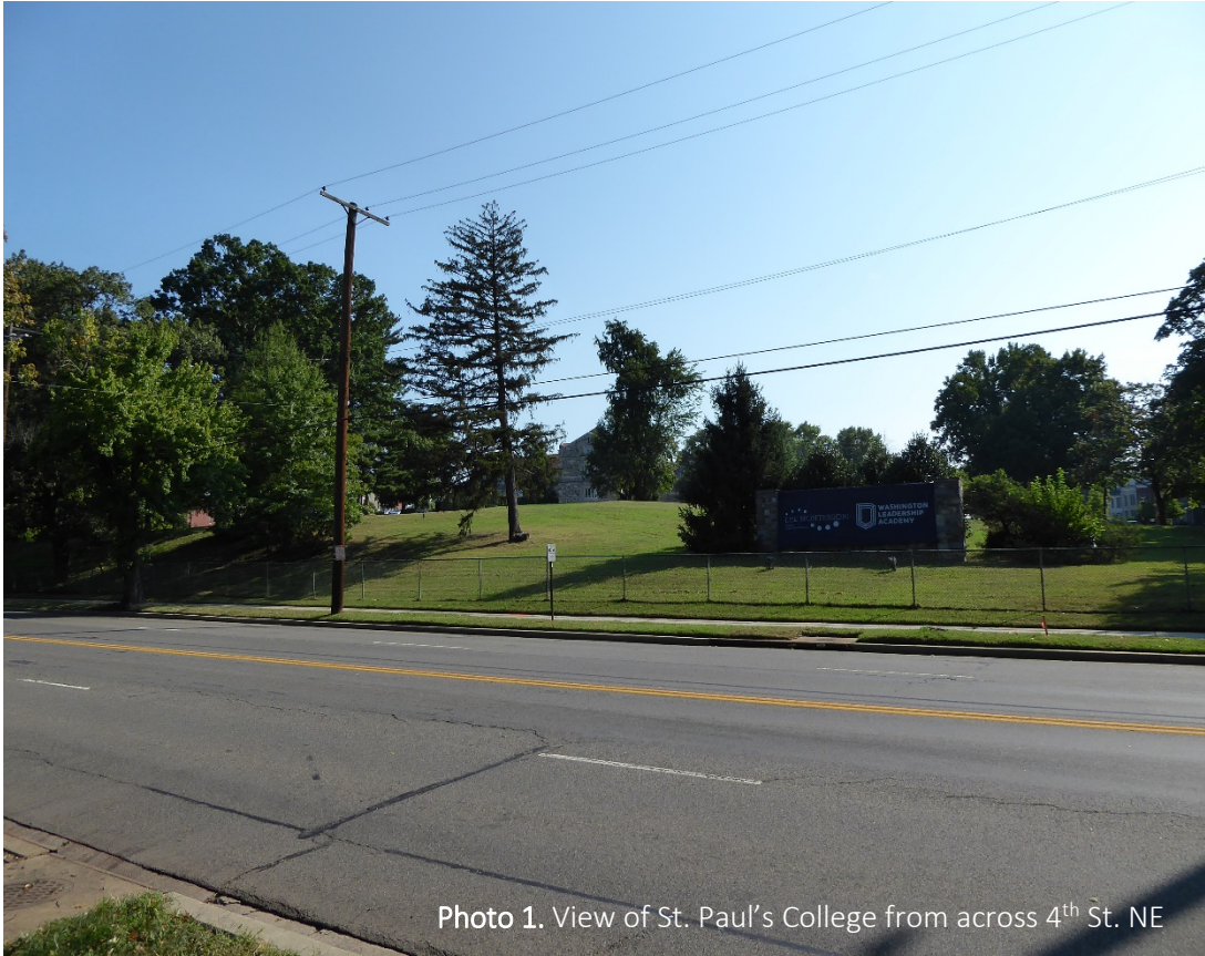
Photo 1. View of St. Paul's College from across 4 th St. NE