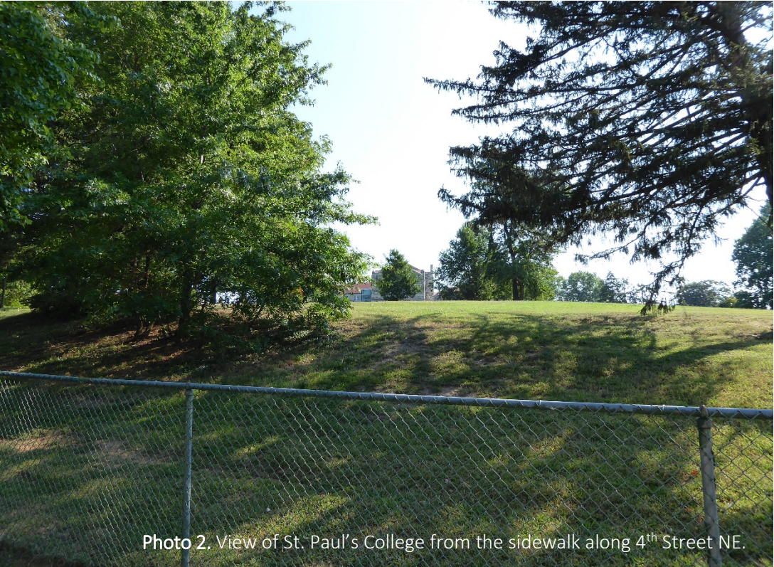
Photo 2. View of St. Paul's College from the sidewalk along 4 th Street NE.